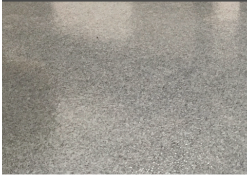
1.650 m 2 Stonhard flooring system

Stonhard is the unprecedented world leader in manufacturing and installing high-performance polymer floor, wall and lining systems. Stonhard maintains 300 Territory Managers and 175 application crews worldwide who will work with you on design specification, project management, final walk through and service after the sale. Stonhard's single-source warranty covers both products and installation.